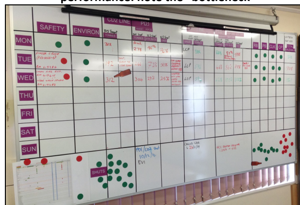
Figure 2: Daily Performance board showing the weeks performance: note the "bottleneck"

The new performance board has been a great improvement for the site and will bring about added value to all departments. The maintenance team for example find benefit from the board to notify people of any upcoming planned Preventive Maintenance (PM) Shutdowns.