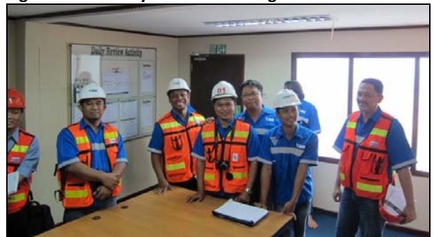
Figure 5: Site Daily Review Meeting Room

The maintenance areas were very impressive with some great enhancements to their stores.