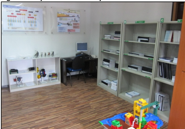
Figure 3: Improvement Library

As we inspected their Coal Crushing Plant 1 Area you could see significant gains since their Level 3 Assessment some 2 years earlier. It is an old plant, yet in excellent condition.