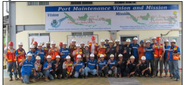
Figure 6: Site Maintenance Team and Store

The maintenance areas were very impressive with some great enhancements to their stores.