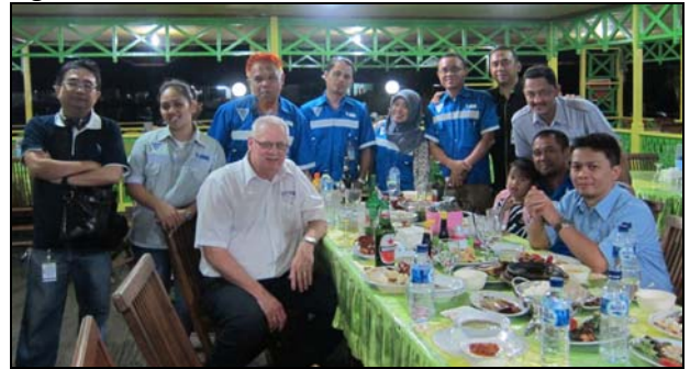
Figure 8: Celebration Dinner

CTPM congratulates Indominco Coal Operations on achieving this great milestone. We look forward to welcoming representatives from the site to Wollongong in August to attend and present an overview of their incredible improvement journey at CTPM's 19 th Annual Forum – CI in Action on 19-20 August 2015.