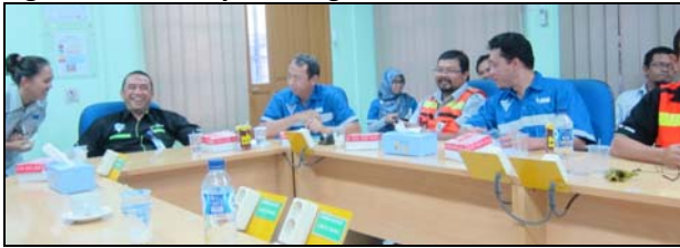
Figure 7: Summary meeting of Level 4 Assessment

That evening it was celebration time, recognising everyone's on-going commitment to their improvement journey.