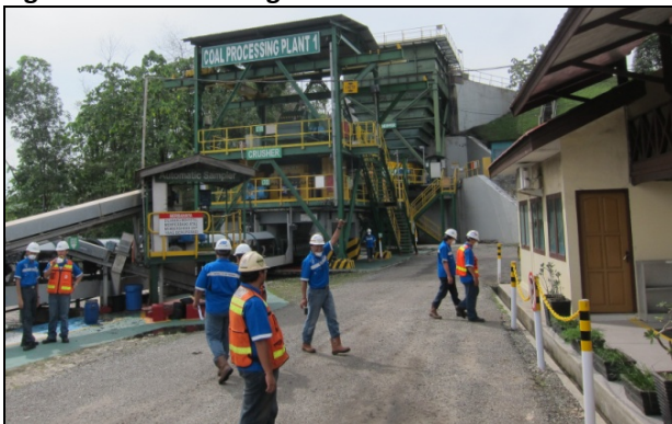
Figure 4: Coal Crushing Plant 1

As we inspected their Coal Crushing Plant 1 Area you could see significant gains since their Level 3 Assessment some 2 years earlier. It is an old plant, yet in excellent condition.